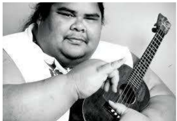
Israel "Iz" Kamakawiwo'ole