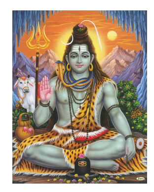
Shiva – the destroyer

Ganges River is an important place of pilgrimage