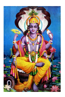
Vishnu – the preserver