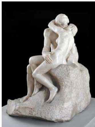
The Kiss (1888 – 1898)