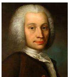
Anders Celsius Swedish Scientist 1701-1744

What are the 4 seasons and why do they occur?