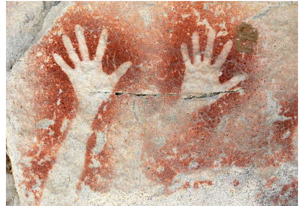
Rock Art found in Queensland – estimated to be 40,000 years old