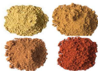
Earthy colours (ochres)