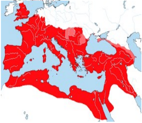
The Roman Empire