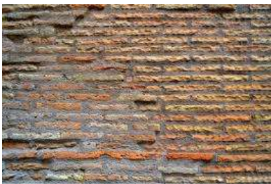
Bricks and Cement