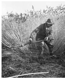
Cut willow for eel traps