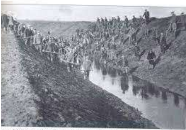
Long straight channels (ditches) were dug. They took the water straight to sea.