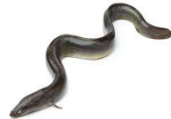
Hunt wildfowl and catch eels