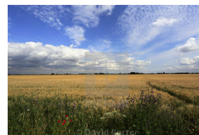
Fields used for farming