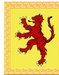
The Fen Tigers were a group of fen people who tried to stop the drainage of the fens.