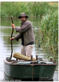
Travel by boat