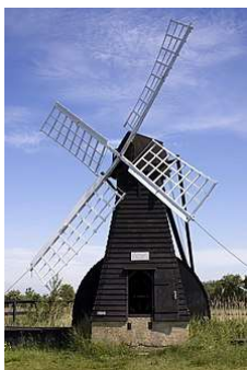
Wind pumps were used to remove water from the land.