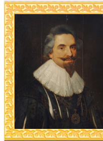
Cornelius Vermuyden was a Dutch engineer who was in charge of draining the fens.