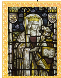
Saint Etheldreda founded the monastery on which Ely Cathedral now stands.