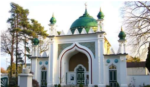
Mosque – Muslim holy place of worship