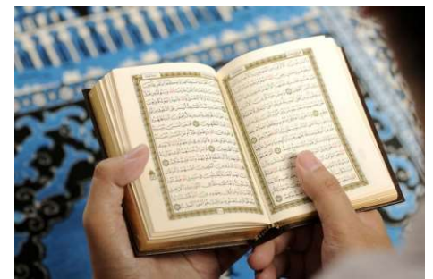
The Quran – Muslim holy book