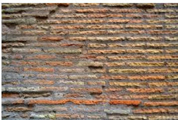
Bricks and Cement