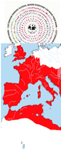
The Roman Empire

What impact did the Roman Invasion have on Britain?