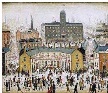
'Coming from the mill' 1930 'Industrial landscape' 1955 'VE Day' 1945

Related (prior) knowledge: colour theory – primary, secondary colours, complementary colours, drawing and shading (various years)