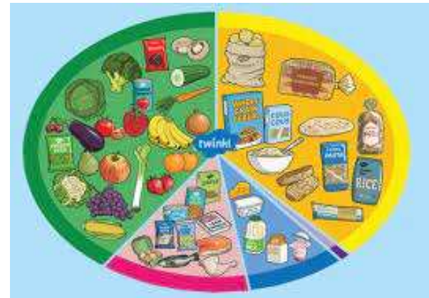
Eat Well Plate

EYFS- Growing and Changing Year 1/ 2 - Senses