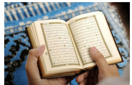
The Quran – Muslim holy book