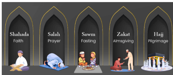
The Five Pillars of Islam