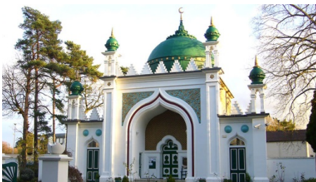
Mosque – Muslim holy place of worship