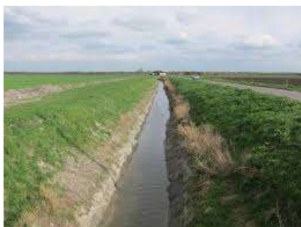
Ditches and dykes