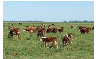
Pastoral farming (only a little)