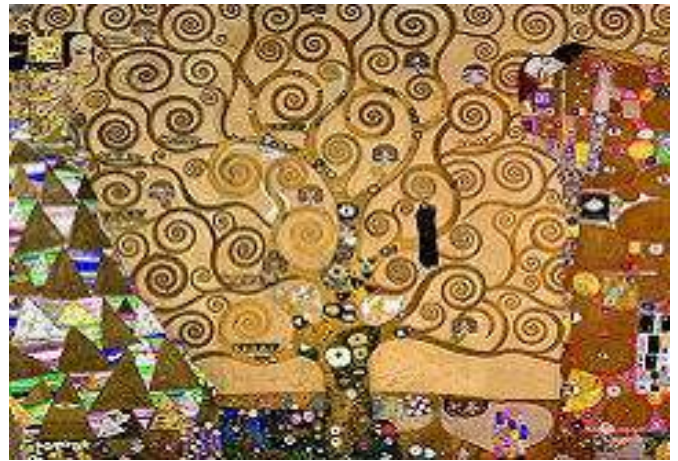
The Tree of Life