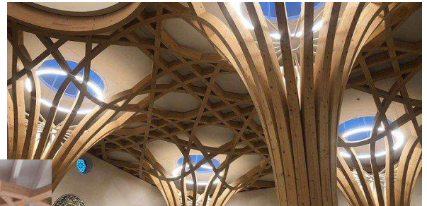
Cambridge Central Mosque has calligraphy on the walls and geometric patterns in the roof.