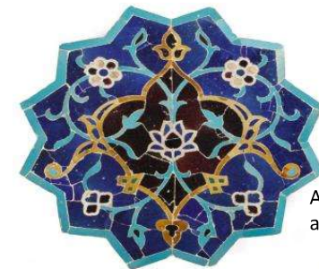
A tile containing a vegetal motif