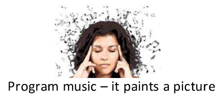
Program music – it paints a picture