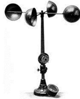
THE EDWARDS ANEMOMETER